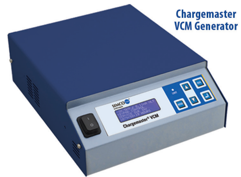
Chagemaster VCM Generator